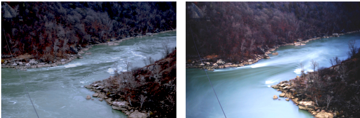
Figure 1. Two images of the same Niagara Falls downstream flow. The left image is an exposure of 1/2 sec, while the right hand image is exposed for 50 sec. Note the flow features visible in the right hand image (stream lines, bow waves, standing waves, vortices, etc.) that are not clearly visible or simply invisible in the left image due to the “noise” of local fluctuations.

Our first experiments consisted of flowing water, in this case the Niagara River just below the falls. The left picture of Figure 1 has a 1/2 s exposure. The right picture is exactly the same but with a strong filter allowing a 50 s exposure. The unsteady flow disappears in favor of smooth streamlines turning to the right and vivid standing and bow waves previously invisible in the “noise” of local fluctuations. We see similar “tranquil” situations in slow-time pictures of trees in the wind and of busy traffic in Figure 2. These pictures illustrate the presence of structure appropriate to different timescales.