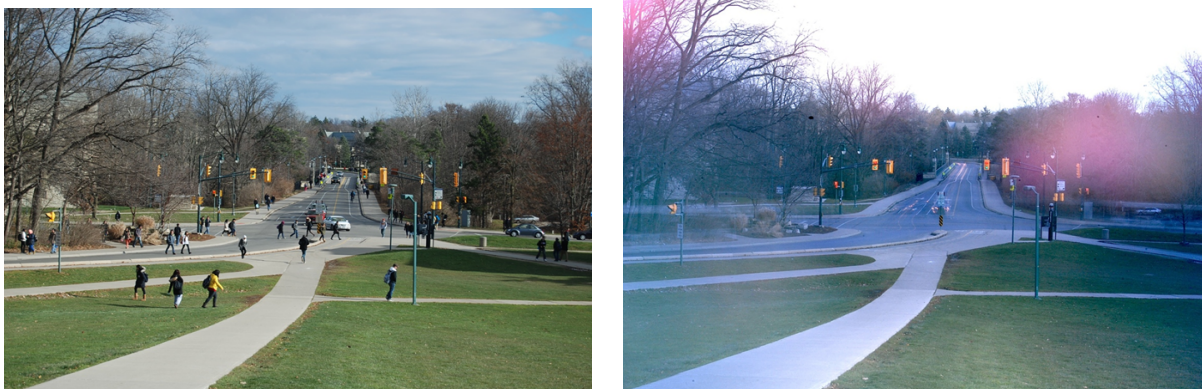
Figure 2. A busy intersection with lots of students, cars, trucks, and busses moving about. The left frame is a normal picture taken at 1/100 sec, the right frame is exposed for 10 min. No moving objects are seen anymore, except for a few very faint shadows. The multiple cars in the left turning lane sit waiting for green, leading to multiple images of running lights in that position. The red-yellow-green traffic lights are all lit at the same time, on average.